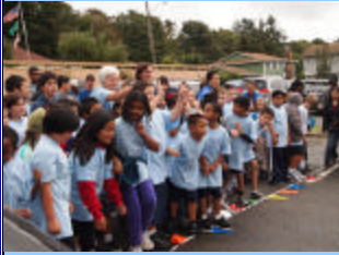
Jog A Thon

“As each one has received a gift, use it to serve one another as good stewards of God’s varied grace.”-